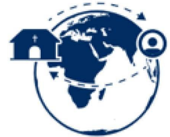
CARE & CONNECTION