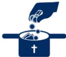
WORLD EVANGELISM FUND