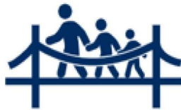
ENGAGE CHILDREN AND YOUTH